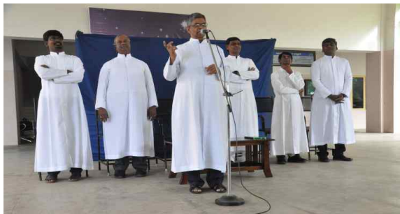
Visitation by Rev. Fr. Provincial